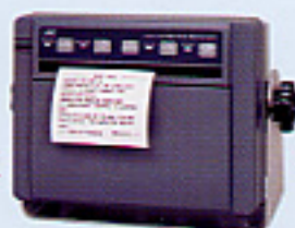
NAVTEX RECEIVER NCR-330