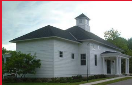
Ideal for All Remote Locations

An optional Beam Battery Backup, can provide 24 hours Standby time and 2 hours of talk time. The terminal is also capable of being Solar Powered.