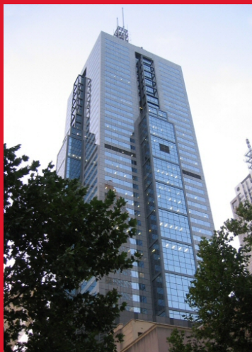
In building / PBX Integration

In-building integration is ideal for lower costs satellite to satellite calling as well as emergency backup to the PSTN networks.