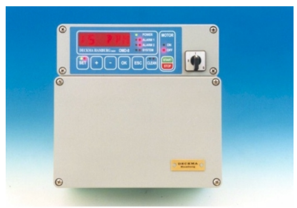
OMD-8 Data Processing Unit