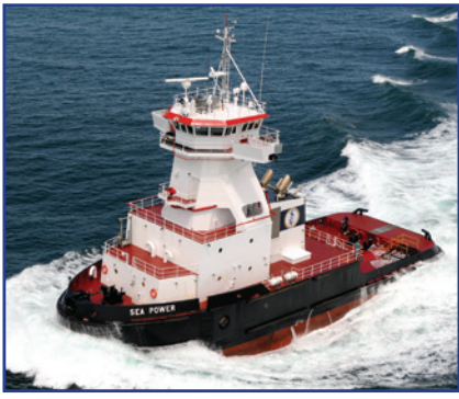
SEACOR Sea Power