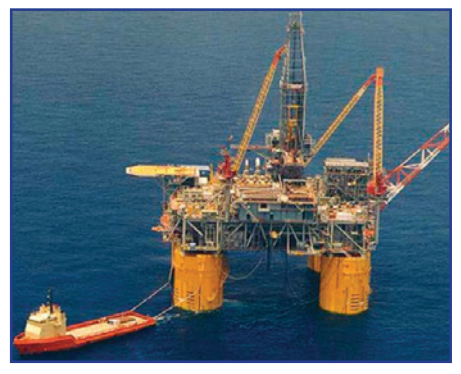
Shell Mars B