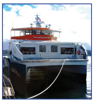
Nichols Brothers Boat Builders: Kitsap MV ENTAI Fast Ferry