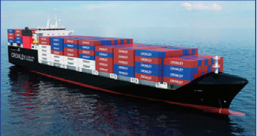
Crowley Maritime: El Coquí ConRo Vessel... 2019 Workboat of the Year