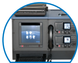
GMDSS Radio Equipment

Take advantage of our Lump Sum Pricing with Mackay's OSV Pre-Activation Inspection Package . This inspection is designed to test the overall operability of IMO-required Navigation and External Communications systems and sub-systems onboard OSVs, and other support vessels that are coming out of a Cold Stack status.