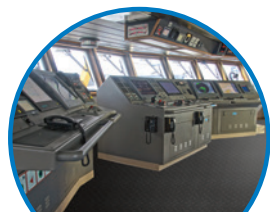
Radar and ECDIS