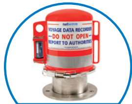
Voyage Data Recorder