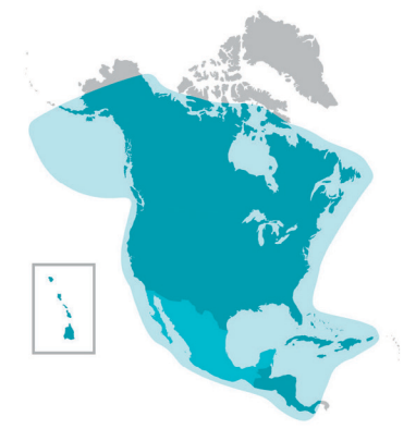
Ligado SkyTerra 1 Satellite Coverage

Ligado's high-powered SkyTerra 1 satellite enables transmissions to small fixed and mobile devices by using a 22-meter reflector-based antenna - the largest satellite reflector on a commercial satellite - bringing more data to smaller devices.