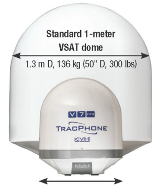
TracPhone V7HTS dome

Streamlined belowdecks unit includes: IP-enabled antenna control unit, built-in CommBox Ship/Shore Network Manager, high-throughput modem, Voice over IP adapter, and built-in Wi-Fi and Ethernet switch.