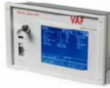
Main control unit

Dimensions (W x H x D): 257 x 157 x 126 mm