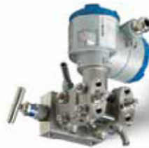
Electronic differential pressure transmitter

Dimensions (W x H x D): 225 x 195 x 194 mm