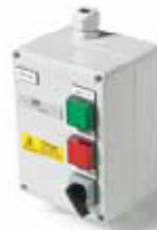
Motor starter box

Dimensions (W x H x D): 126 x 176 x 100 mm