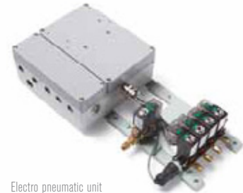
Electro pneumatic unit